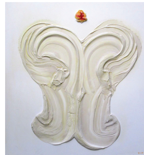
Me, Myself and I

"I was fascinated by my deeply felt thought that tree branches remind me of hands. In this painting, the tree branches are shadows in the snow."