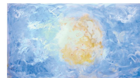
The Courage to Hope

"This painting was the result of listening to the brass quartet while standing in the back at the Aspen Music Festival in 2004."