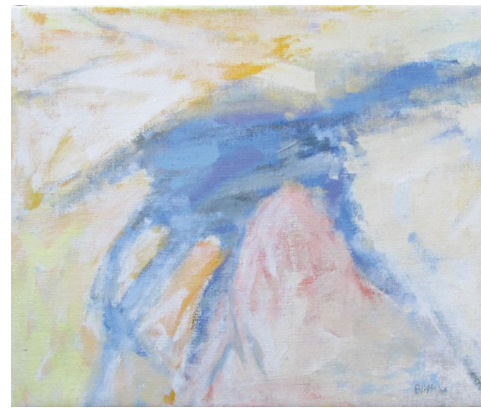
Hand-like Branches Make Shadows in the Snow